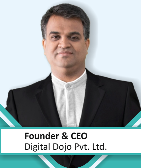
Founder & CEO Digital Dojo Pvt. Ltd.

MBA (Marketing - 2007), Melbourne Business School, University of Melbourne, Australia MBA (Exchange - 2006), Rotterdam School of Management, Erasmus University, Netherlands MA (Political Science - 2016), Indira Gandhi National Open University, Delhi, India BE (Electronics - 1999), VJTI (Victoria Jubilee Technical Institute), Mumbai University, India